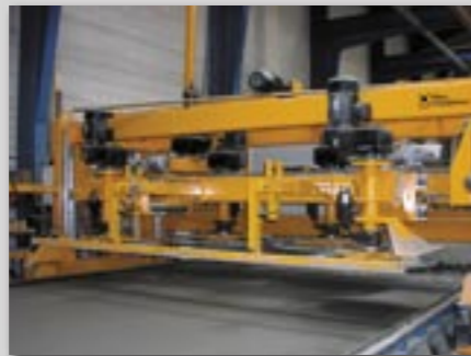
Surface finishing machine.