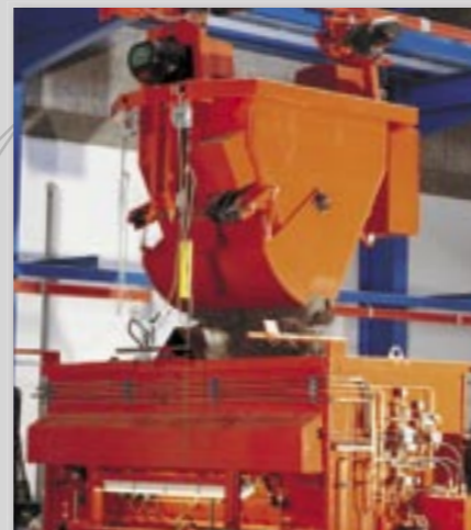
Single rail concrete skip conveyor with bottom discharge equipped with hoists for lowering skip.

Transport of moulds to and from the curing racks operated by automatic cranes or by roller conveyors combined with elevators/lowerators.