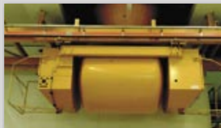
Dual track skip conveyor with rotation discharge.

Also gantry and half-gantry cranes are available.