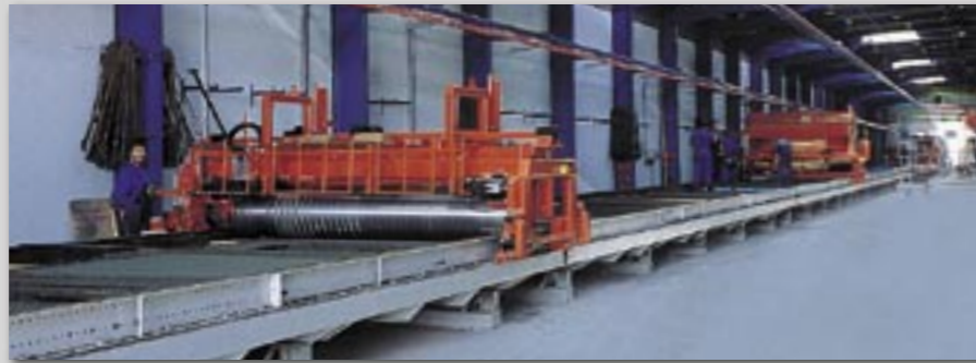
Production line for lightweight concrete wall elements.