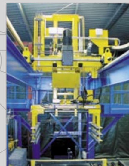
Cuber with servo-controlled movements.