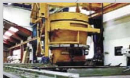
Overhead travelling concrete crane. The skip with integrated rotation can be lowered for casting and for levelling the concrete.