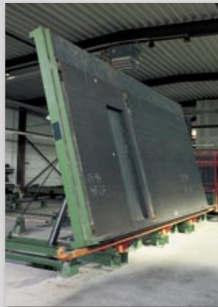
Tilting device for circulation tables.