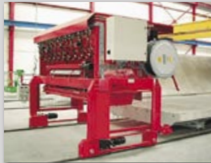
Spreader for lightweight concrete equipped with discharge gates and computer controlled concrete scraper.