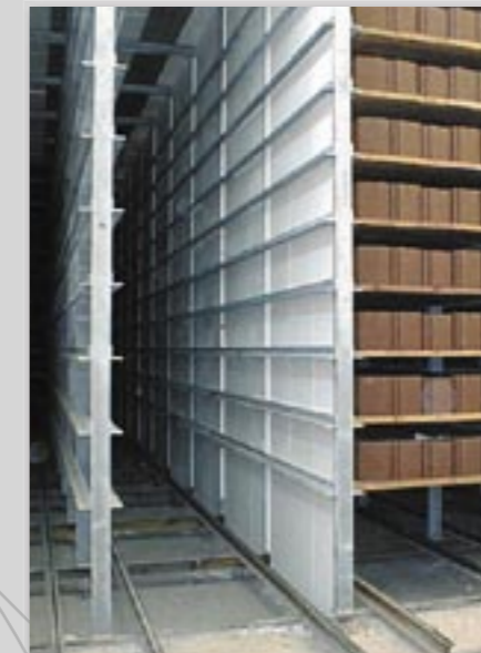
The curing racks are constructed in hot dip galvanised steel profiles.

fibro intercon's high quality moulds can be supplied with bolt in wear parts for easy replacement. All wear parts are made of highly wear-resistant steel.