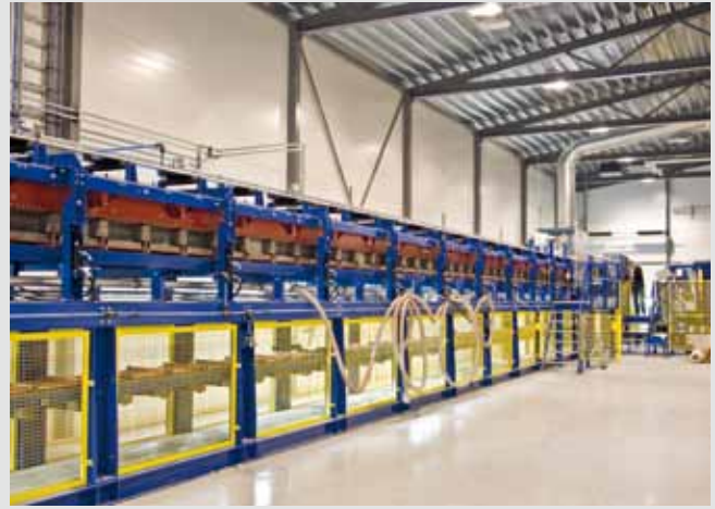
Insulating line with L-shaped apron plates